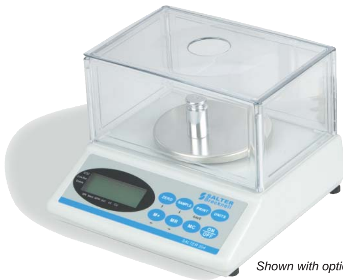
Shown with optional draft shield